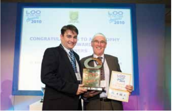
J D Wetherspoon – Overall UK Winner